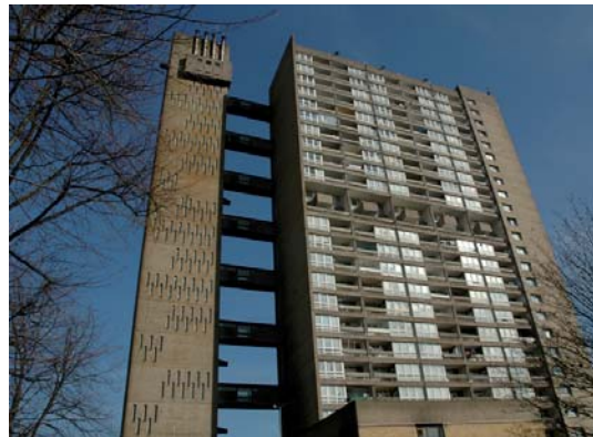
Balfron Tower, now part of the Bow Arts Trust live/work scheme

Bow Arts Trust aims to support artists by providing secure, affordable studio space as well as offering opportunities for employment and community engagement. The Trust is committed to serving the residents of Tower Hamlets in London, one of the poorest boroughs in the country, through investment