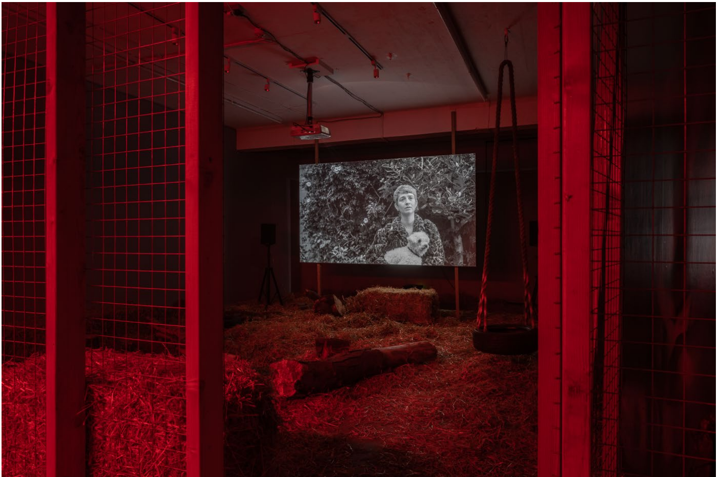
Installation image of Pedigree (2022) at Seventeen London, photo Damian Griffiths

Biennial moving image showcase Visions in the Nunnery to present new work by Patrick Goddard , acclaimed film duo Webb-Ellis and 42 artists from across the globe