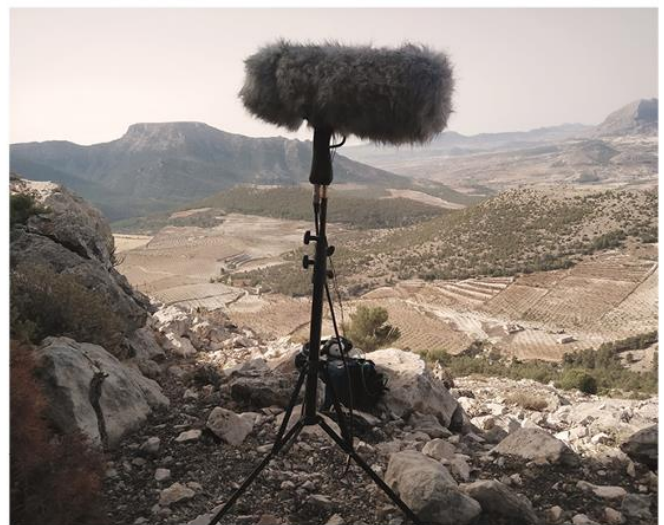
Images, top row: Ex Nihilo © Annabel Duggleby, Steal Life (still) © Nana Maiolini; bottom row: © Matt Parker