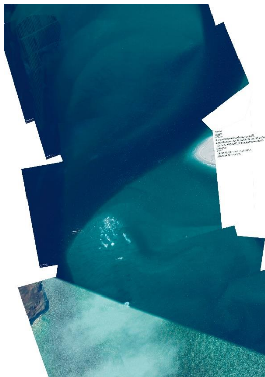
Images, left to right: Marcus Orlandi Men try harder 2019; Nye Thompson INSULAE British Sea Types (Fairisle) 2019