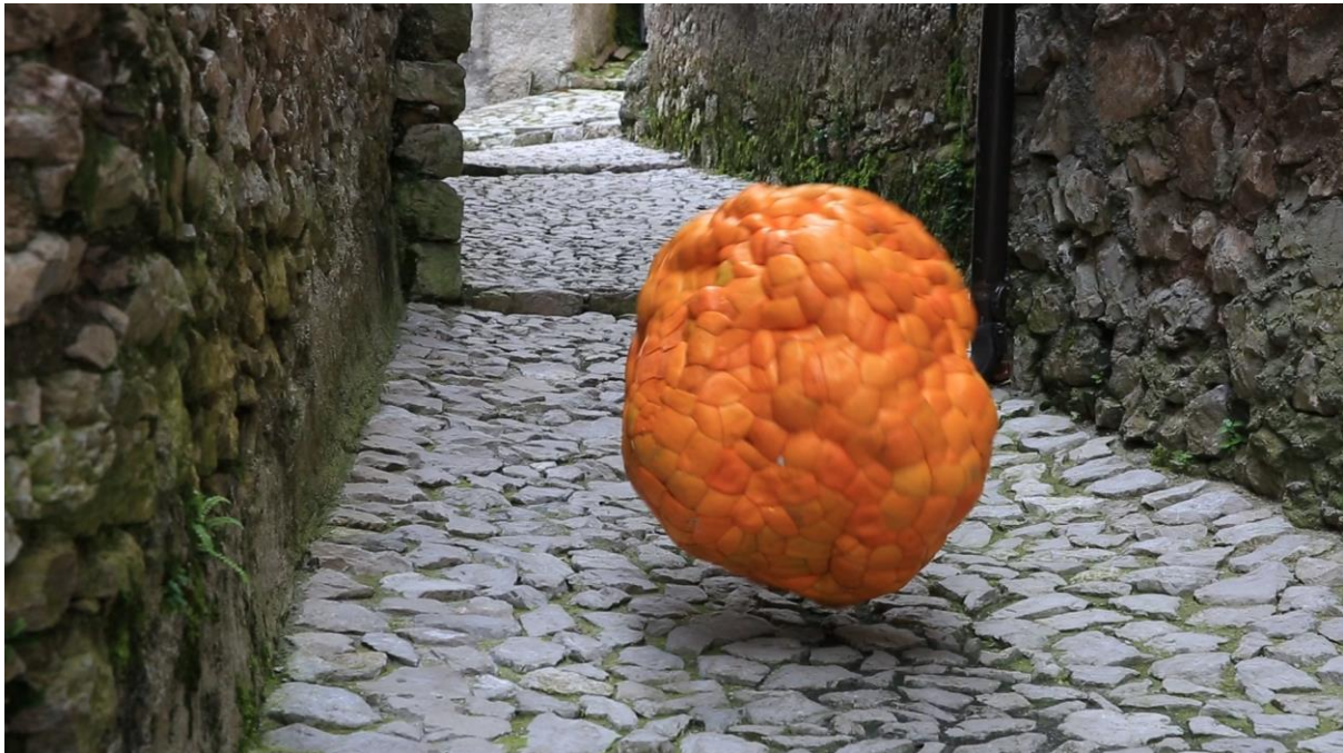
Still from Invasione Pacifica , Jeremy Laffon, courtesy the artist.

Gersht's works are beautifully crafted and use deceptively simple subjects that result in often surprising or unexpected transformations or a 'shattering of reality'. This is a unique opportunity to witness the development of his moving image practice, which highlights the relevance of a fragmented and augmented world as an ever-present contemporary condition.