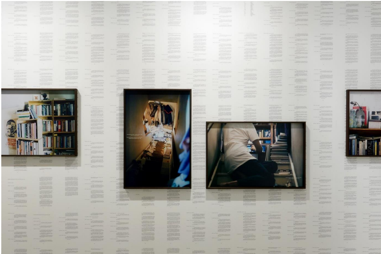
Installation image of Hannes Schüpbach & Stephen Watts | Explosion of Words , Literaturmuseum Strauhof, Switzerland