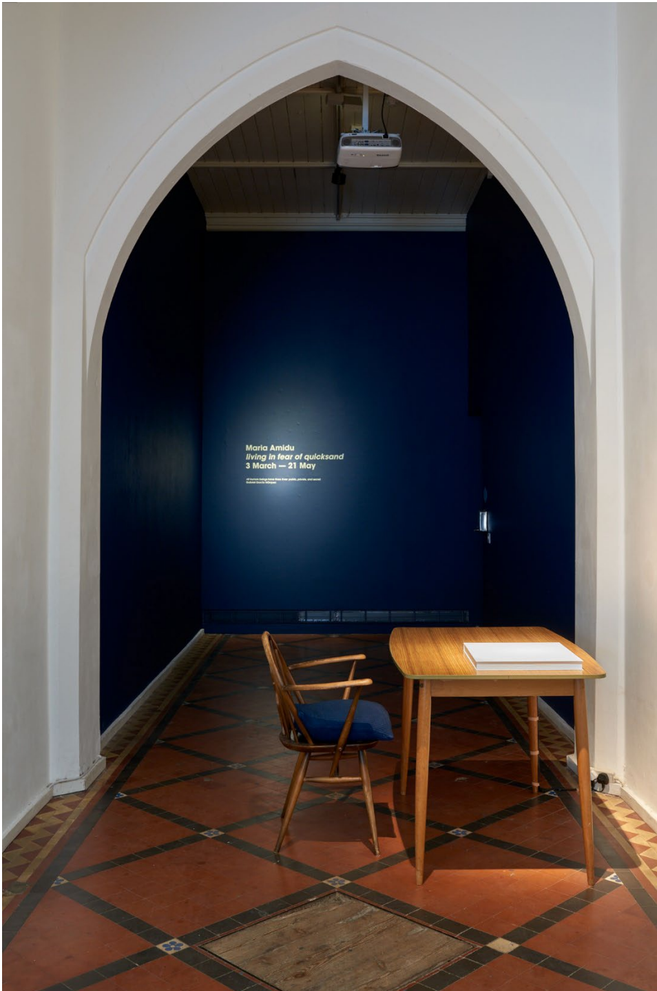
air , 2022, installation, Nunnery Gallery

A limited-edition print work – 25 years in the making and the genesis of living in fear of quicksand , a film piece, a sound work, a text-based installation and a bespoke paint colour are being exhibited for the first time. The print work – a memoir of sorts – traces the artist's early childhood living in Sleaford House on the Lincoln Estate (within walking distance of the gallery); growing up in state care in Bexhill-on-Sea; and consequential experiences in her adult life.