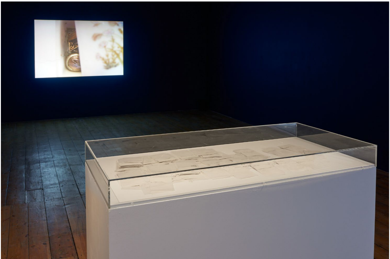
living in fear of quicksand, installation, Nunnery Gallery