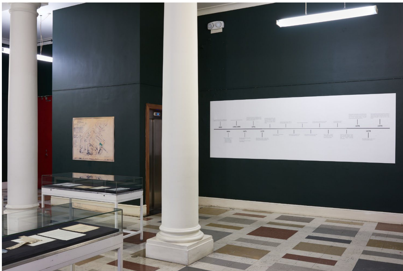
living in fear of quicksand, installation, Tower Hamlets Local History Library & Archives.

The development of the artist's new work and the exhibition is supported by Arts Council England and supporters who wish to remain anonymous.