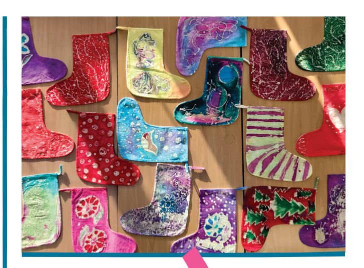
'Peer to peer engagement has worked really well across all classes' Teacher