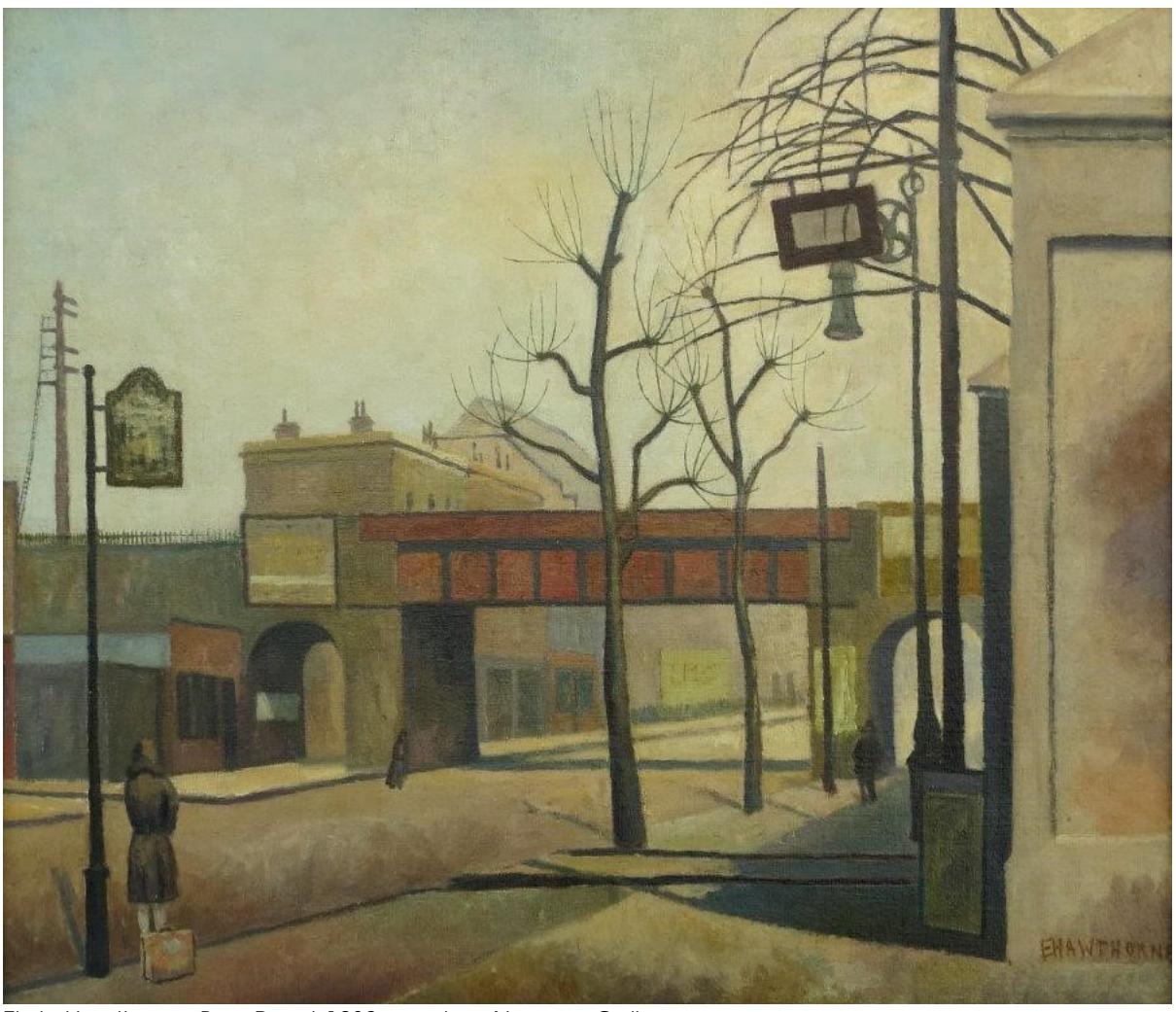
Elwin Hawthorne Bow Road, 1932